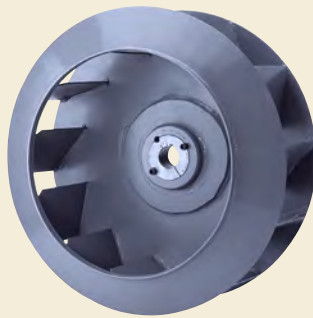
Rebuilt and placed back in operation.