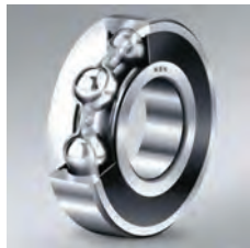
Bearings that are subject to wear