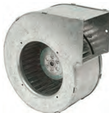
Overhung air foil