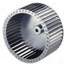
Repaired fan cage